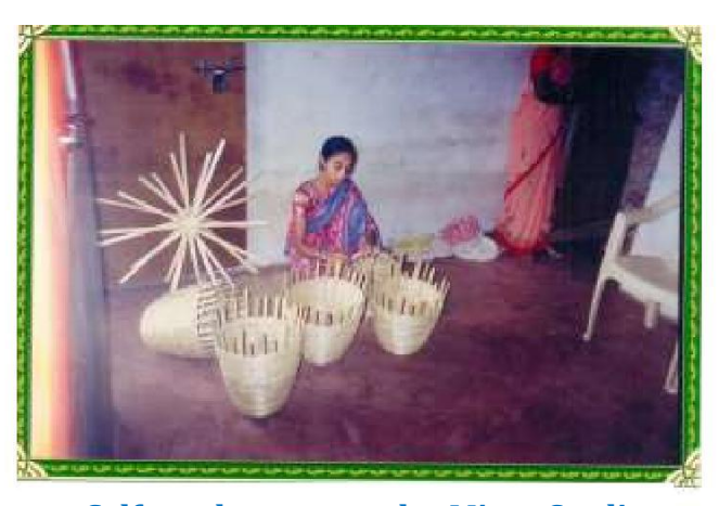
Self employment under Micro Credit

Residential and non-residential education support.