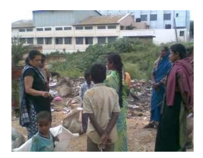
Discussion with Rag-picking families in the field