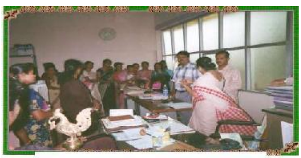
Dialogue with Women leaders

This module of growth is a movement among the poor and disadvantaged, to support and sustain their development and empowerment process, through mutual support.