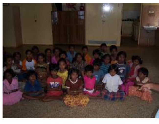
Pre-school Non-formal education to slum kids

Other services – child rights, health care, rights access etc