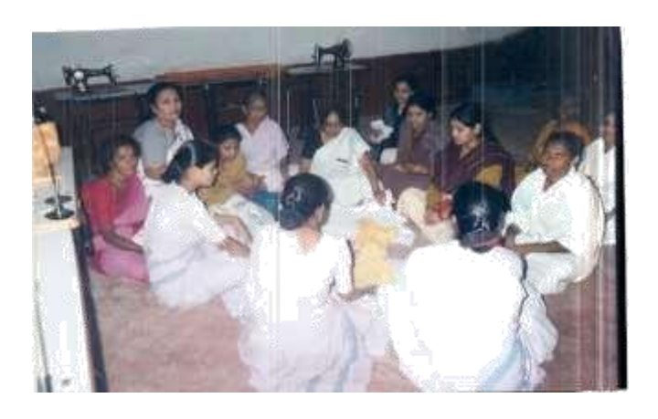
Skill Training for Women in Prison