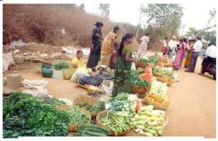
Organic sales on State Highway road by Organic Farmers