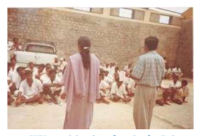
HIV sensitization class in the Prison