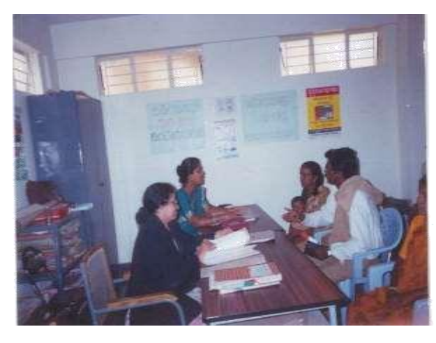
Legal counseling at Santhwana Desk