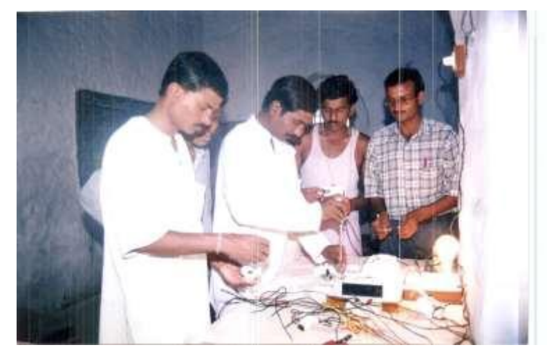
Employment skills for youth