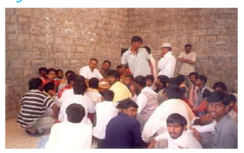
Youth under trails at group work with Janodaya