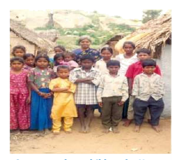
Quarry workers children for Nonformal school