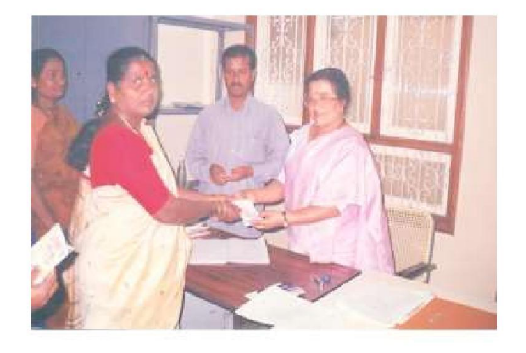
Livelihood enterprise loan disbursement