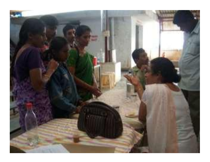
Services Information desk