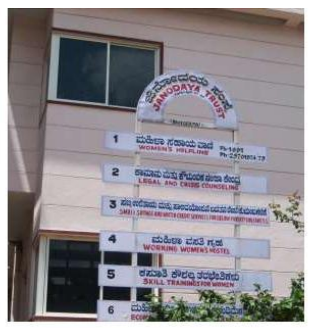
Janodaya – Women's Help line at Koramangala