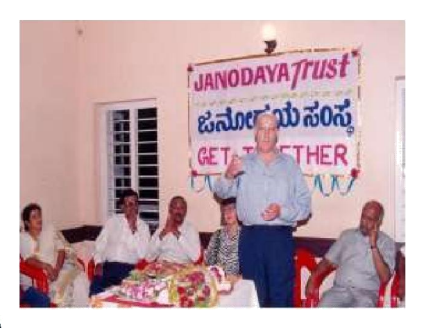
Foreign Donors participation

Banks – SBI, Corporation bank, AXIS, FWWB etc NABARD