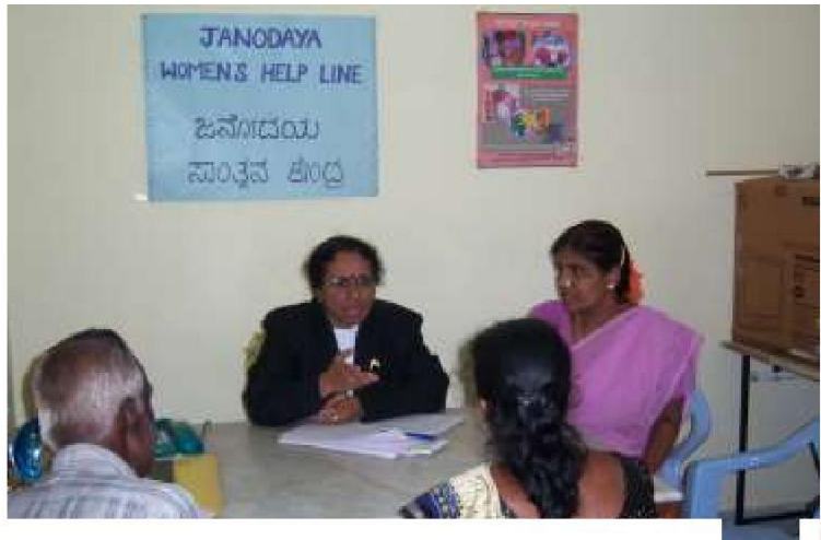
Case settlement by Advocate at Women's Helpline desk